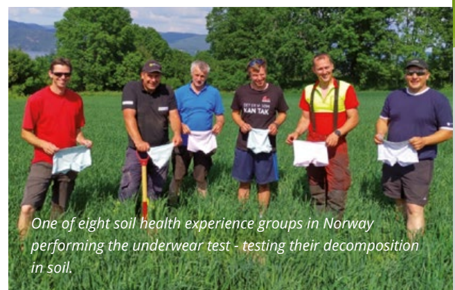
One of eight soil health experience groups in Norway performing the underwear test - testing their decomposition in soil.

This leaflet contains ideas and information on measures you can take to combine food and biomass production with Carbon Farming. Important is a constant and consequent management on your farm, due to the reversibility of SOC binding. Best is to try a combination of different new approaches!